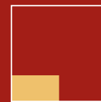
1/8 PAGE (HORIZ) 4.931" x 2.312"