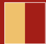
1/2 PAGE (VERT) 4.931" x 9.762"