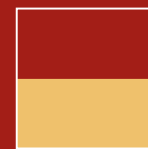
1/2 PAGE (HORIZ) 10" x 4.812"